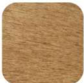
Golden Oak Part # NUB_W_GO