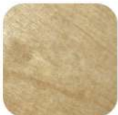
Natural Tone Part # NUB_W_NL