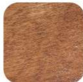
Gunstock (Cherry) Part # NUB_W_CH