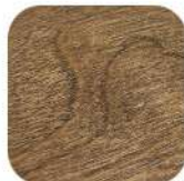
Walnut Part # NUB_W_W